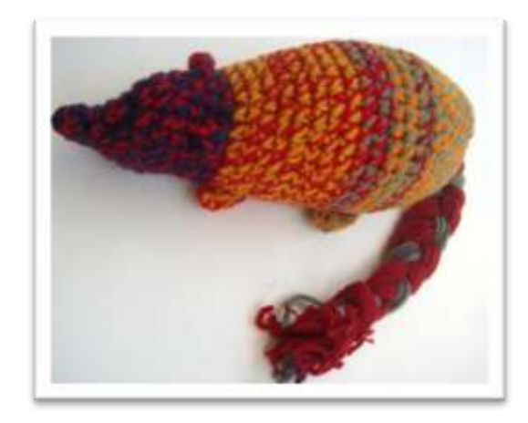
A Doe Rat made from scrap balls