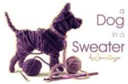
The following page is a printable pattern cheat sheet. Its purpose is to remind you of the rounds once you are already familiar with the pattern. Please limit all paper use for the sake of our planet.