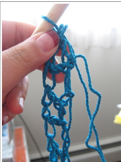
V stitches at the end of the first foundation chain.

To mimic the colour changes in the example, switch to a second colour on the 8 th row and work 4 rows in this colour.