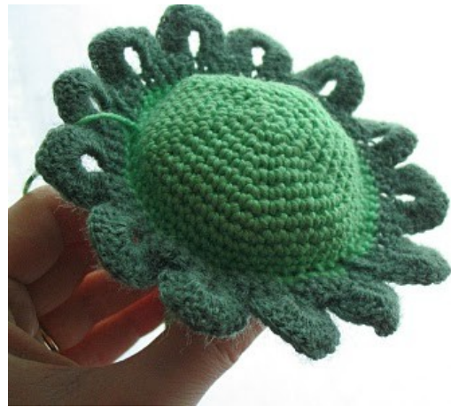
Assembly 2: flowers