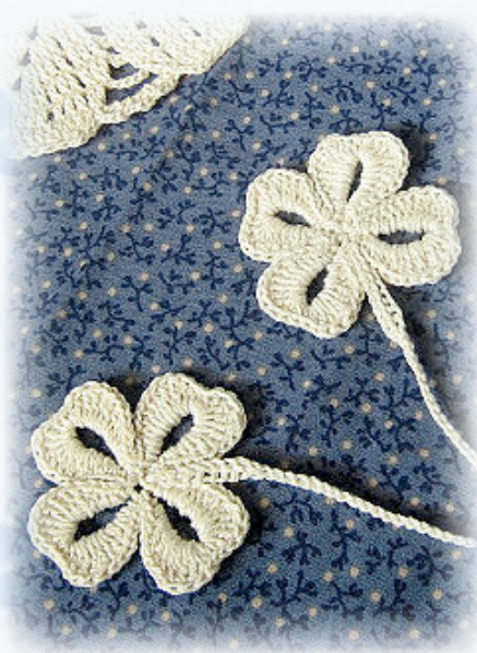
Two rounds of crochet stitches plus a long tail of fringe; probably the simplest crochet bookmark ever!