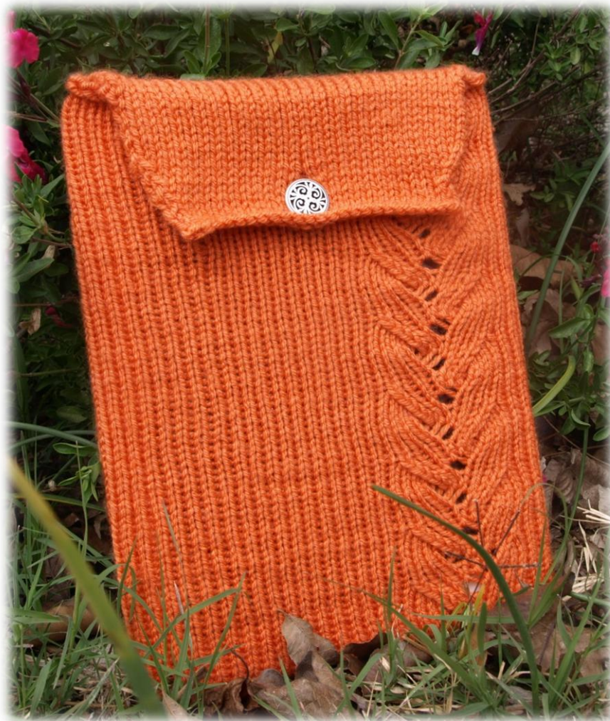
iPad 2 in Knit Picks Brava Worsted

The popular Kindle cover is now available for the iPad Family! Cozy Fire is knit like a toe-up sock on a magic loop, so you can try it on as you go. It has a simple flame lace pattern and a one-button closure. It is a quick knit and a perfect companion to your iPad (1 st , 2 nd , 3 rd , or 4 th generation), iPad Mini, and even your iPad in its OtterBox!