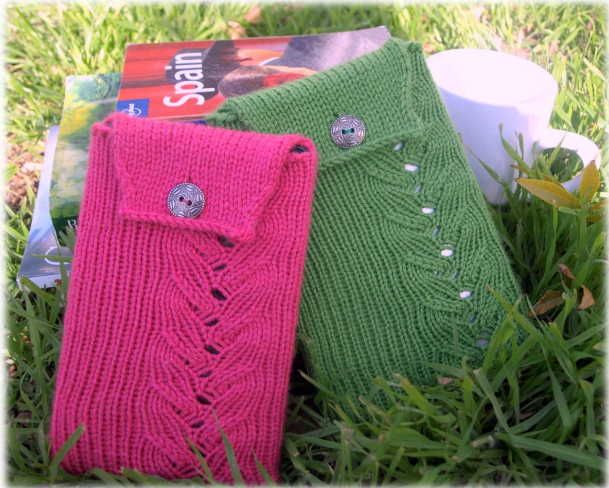
Kindle Fire (Left) and Kindle 2 (Right) Cozy Fire knit in Knit Picks Brava Worsted

Cozy Fire is knit like a toe-up sock on a magic loop, so you can try it on as you go. It has a simple flame lace pattern and a one-button closure. It is a quick knit and a perfect companion to your Kindle Fire, Kindle 2, Kindle 3, Kindle HD, or Kindle HD 8.9"!