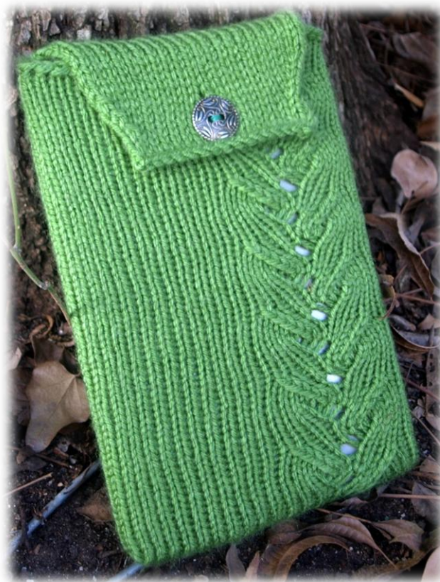
Cozy Fire for Kindle 2 knit in Knit Picks Brava Worsted