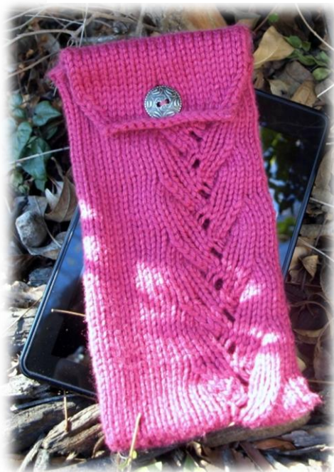
Cozy Fire unstretched, knit in Knit Picks Shine Worsted

You can find links to useful tutorials for techniques used in this pattern (like Judy's Magic Cast-On and Jeny's Surprisingly Stretchy Bind-Off ) and ideas for extra touches to perfect your Cozy Fire at knit-knerd.blogspot.com .