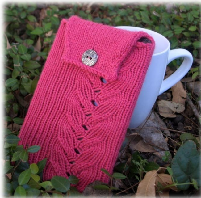
Cozy Fire for Kindle Fire knit in Knit Picks Brava Worsted

Secure button. Weave in ends. (Optional: add a single crochet or crab stitch border to the flap.) Enjoy!