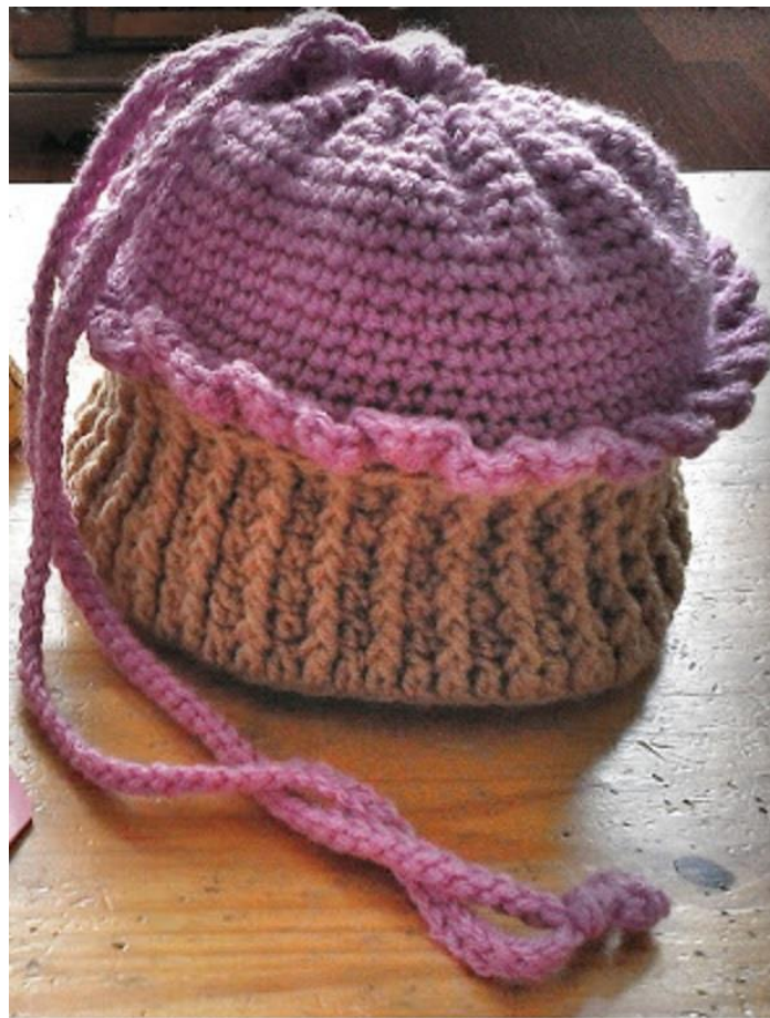
Photo courtesy of Dianne Velazquez-Hunt ; bag made by yours truly <3

I made this bag for a swap on Google Plus. It was pretty easy to make and I loved the end result. I basically took my Cutie Cupcake pattern, supersized it, and voila!