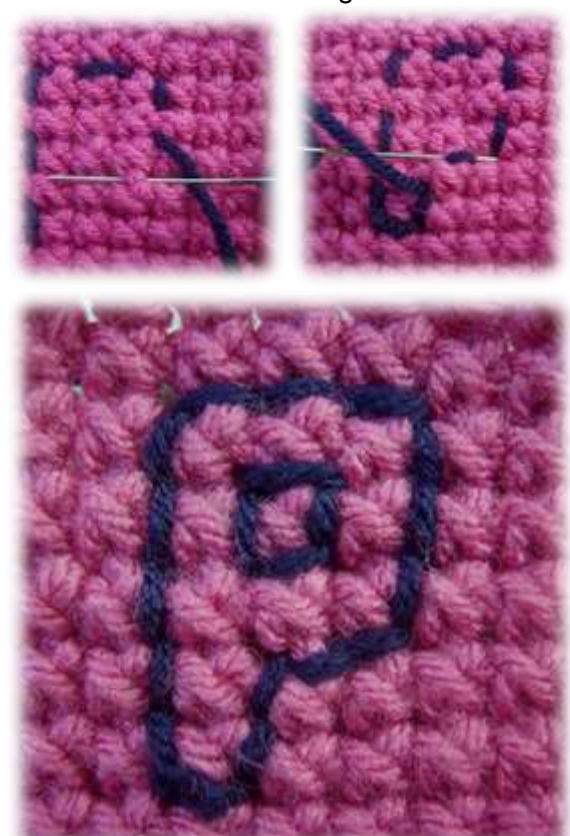
Using the chart as a guide, stitch around the OUTSIDE of the shape only, then add any center. You can go in and out in one direction, then turn back to fill in the gaps.

Method 1: Embroidery Use the 'squares' represented by one stitch as your guide to outline the letters of a name or label onto the bag.