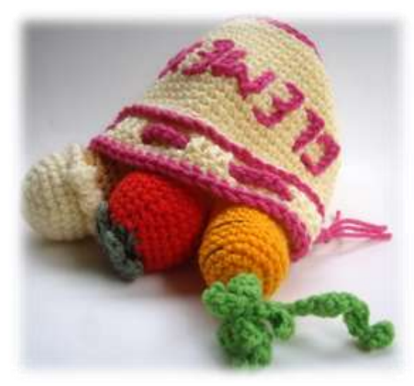
Toddler Toy Bag Jenna Wingate Designs