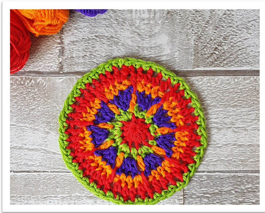
Crochet Pattern by Jo Creates

I always have lots of scrap ends of yarn that I'm not sure what to do with. Earlier this week, I looked at my desk at work and decided that it was VERY dull and needed brightening up with a nice coaster for my mug.