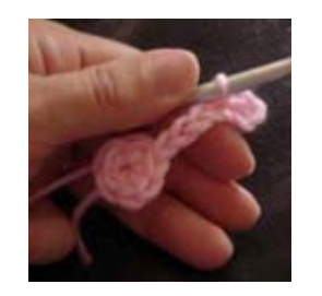
Slip stitch in the 3rd from the hook stitch.