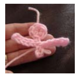
Slip stitch in the 3rd from the hook stitch (this loop will be the center of the skirt).