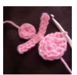
TC 6 in the loop - the skirt is ready.