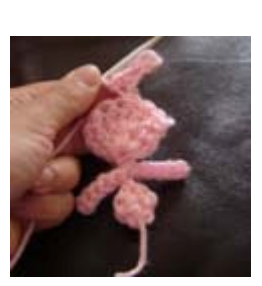
Slip stitch, SC, SC, slip stitch in the next stitch of the edge of the skirt - the lags are ready.