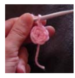
CH 3, join in a ring with a slip stitch. SC 6 in a ring, slip stitch. The head is ready!