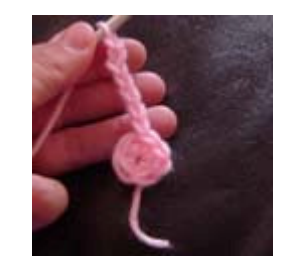
CH 7 (CH 1 for the neck and CH 6 for the arm).