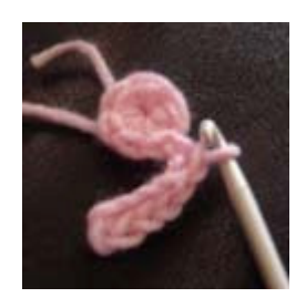
Make 4 more slip stitches, this is the first arm.