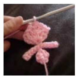
Turn, make 3 slip stitches along CH 5 the edge of the skirt.