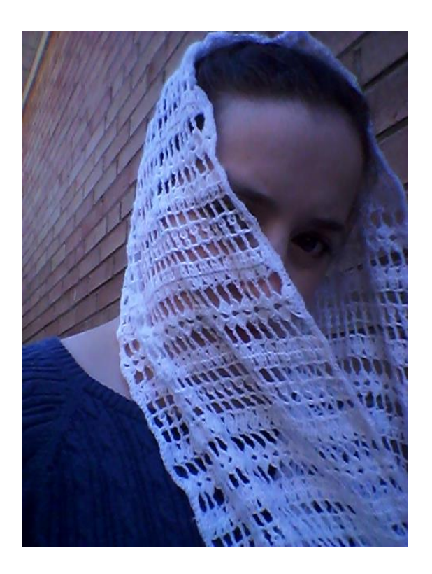
To make the cowl: (connect the strips together)