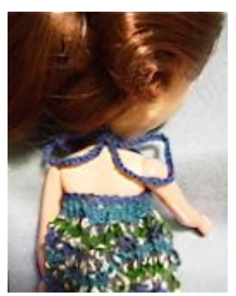
Back showing fastening for all the dresses

With 2.75mm needles cast on 72sts and work in Rnds as follows (it helps to use a Marker at the beginning of the rnds)