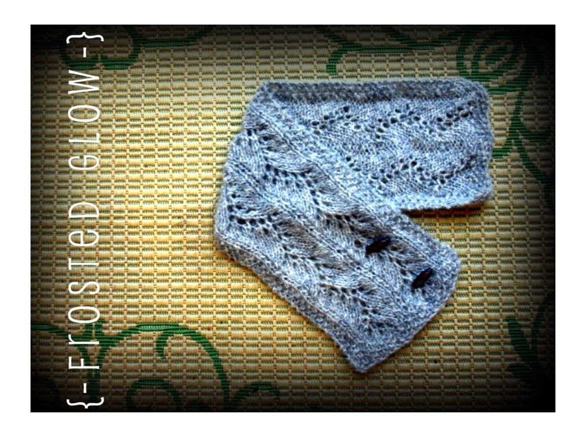
Today I have prepared a pattern that is perfect for the colder weather lurking around the corner. Even on a drab day, this 'Frosted Glow Cowl' will be sure to add that touch of luxury (not to mention warmth) to your outfit.