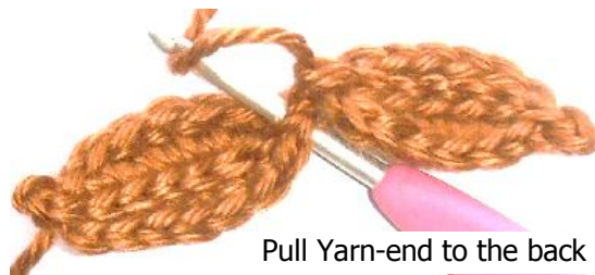
Pull Yarn-end to the back