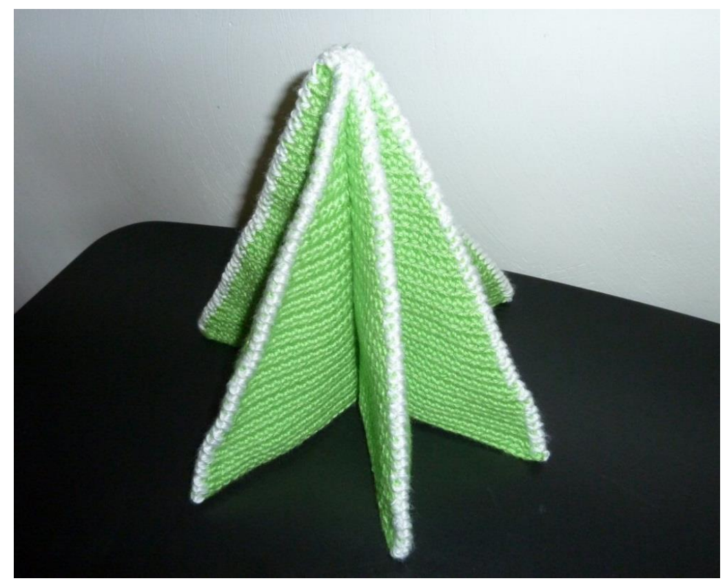
2013 P Perkins http://grandmaperkinscrochet.blogspot.com/