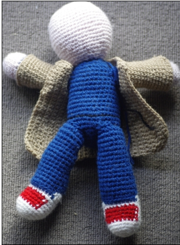
Assembled body and overcoat