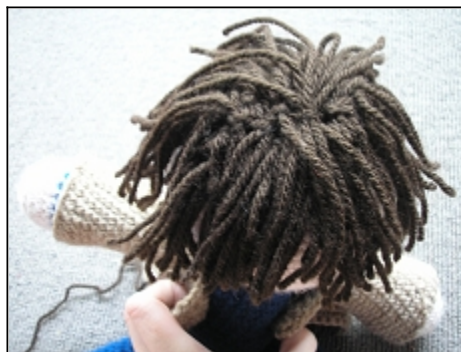
Hair positioned on head

With scissors, cut the loops to free the ends of hair.