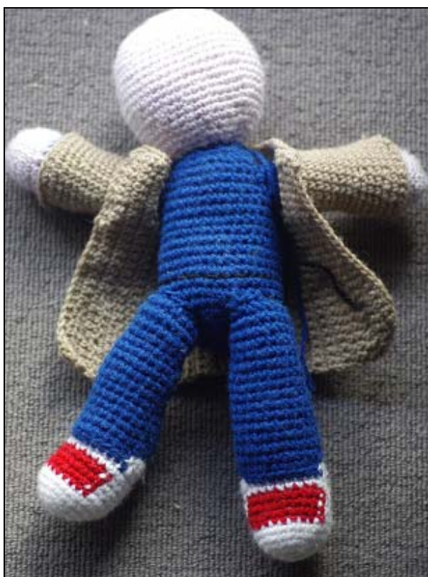
Assembled body and overcoat

With scissors, cut the loops to free the ends of hair