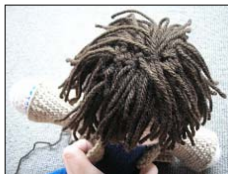
Hair positioned on head