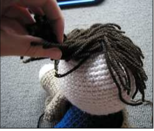
Design © 2010 Nyss Parkes. Please see front page for permission details.