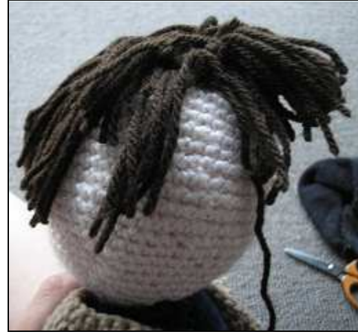
Give the strands of hair a little trim so they don't all look the same length