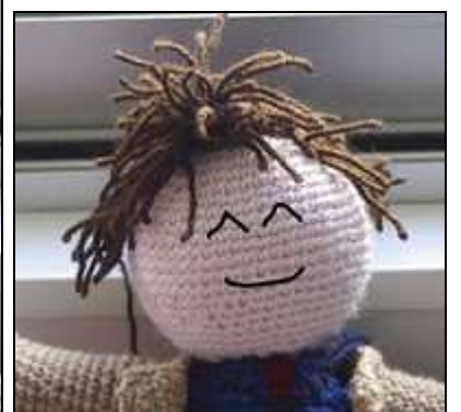
Design © 2010 Nyss Parkes. Please see front page for permission details.