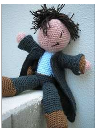
example of overcoat on Jack

31) turning ch1, sc v 32) turning ch1, sc28 = 28 (to make armhole) ^ 33) turning ch1, sc28 v 34) turning ch1, sc28 v 35) turning ch1, sc28 v 36) turning ch2, hdc8, sc20, ch6 = 34 ^ 37) turning ch1, sc v 38) turning ch2, dc11, sc23 ^ 39) turning ch2, hdc8, sc26 ^ 41) turning ch2, hdc8, sc26 ^ 41) turning ch1, sc v 42) turning ch1, sc ^ Cut off leaving a long tail and thread end through loop on