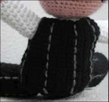
Jack and Ianto can now hang out together:)