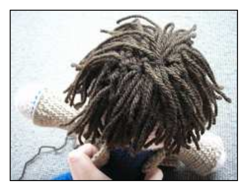
Hair positioned on head

Take hold of a chunk of hair at the front, using some from either side of the part