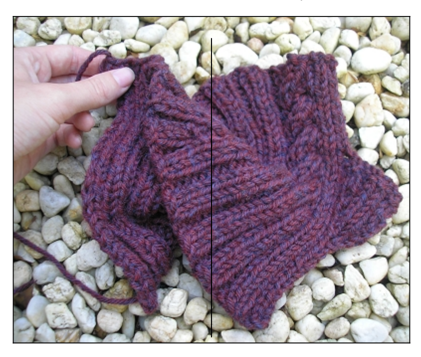
Fold the left half of work <u>under</u> the right along centre line