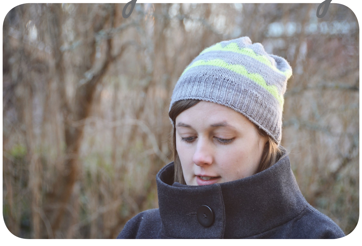
by Veera Välimäki

Splash a bit of colour into the season! This small scalloped beanie is easy to knit with only a few rounds of stranded colorwork.