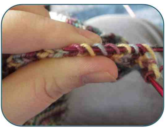
STEP 3: Once you've picked up all of the slipped sts (and perhaps a few extra between the slipped sts and the instep if it seems like there might be a gap there), take a new needle and knit the picked-up gusset sts THROUGH THE BACK LOOP. This will twist the stitches and give you a nice, solid gusset.