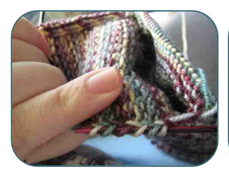
STEP 6: Now knit these picked-up sts THROUGH THE FRONT LOOPS in order to twist them.

STEP 5: For the other gusset, pick up the FRONT LEG of the slipped sts from FRONT TO BACK.