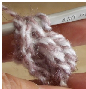
sc through top of 1 st & last sts