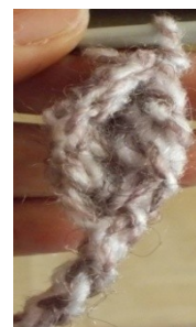
little conch shell