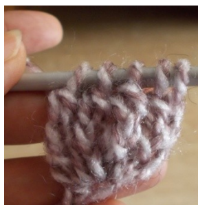
5 lps on hk

"Conch Stitch" : Yo twice, hk into 5 th ch from hk, yo, draw through 1 st lp ; [yo, draw through 2 lps] twice (2 lps on hk) ; *(yo twice, hk into same st, yo, draw through 1 st lp, [yo, draw through 2 lps] twice)* ; rep from * to* twice (5 lps on hk) ; yo, draw through all 5 lps. 1 sc through the top of the 1 st and last (trc) sts just made. One "Conch stitch" made. [Turn this st and it should look like a little conch shell]