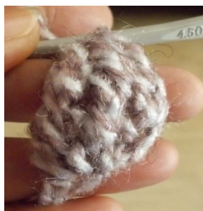
draw through all 5 lps