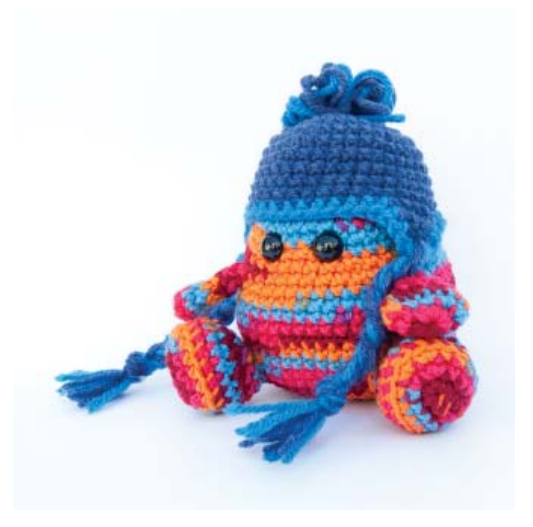
Thing Pattern (Free Download)

For fun patterns to use with this hat, visit my website at: www.itsybitsyspidercrochet.com