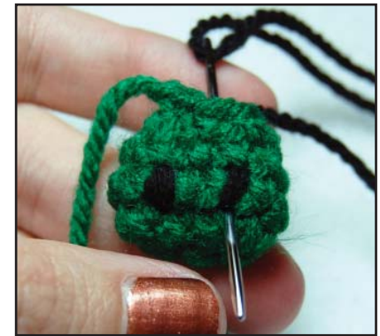
Figure 5: Eyes