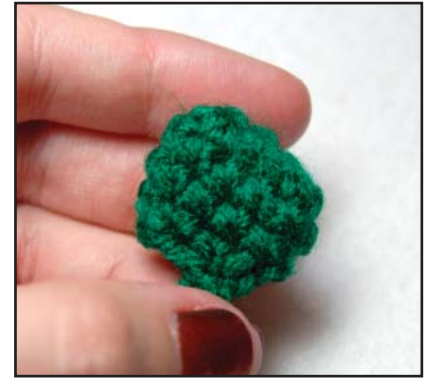
Figure 4: Head

For my eyes, I went over a single-crochet stitch in round two three times with black yarn and the tapestry needle. I then added a little sparkle with some white yarn.