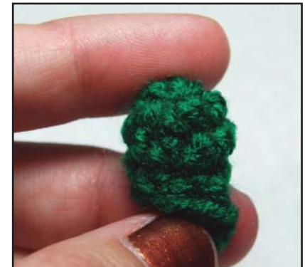
Figure 6: Legs

FO after round three, leaving a tail for sewing.