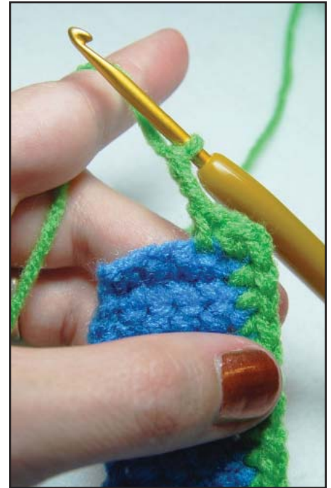
Figure 9: Button loop

Note: If you are making the cuff bracelet for a child under the age of three, omit the chain stitches on the short end of the bracelet and instead SC across evenly. See Part 7: Finishing for Children Under Three for more details.