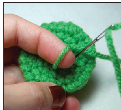
Figure 3: Button loop