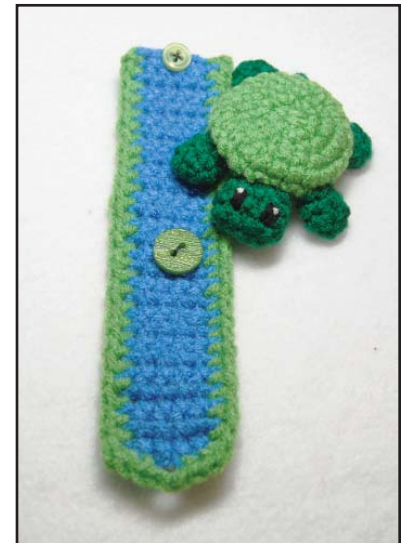
Figure 10: Button placement