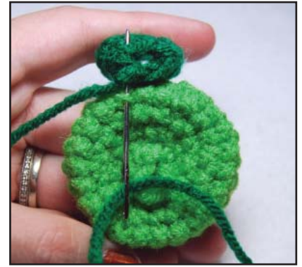
Figure 7: Body assembly