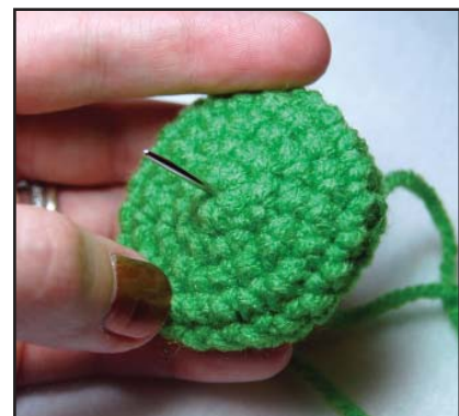
Figure 2: Sewing body

Note: If you are making the cuff bracelet for someone under the age of three, skip step number three above and see Part 7: Finishing for Children Under Three.