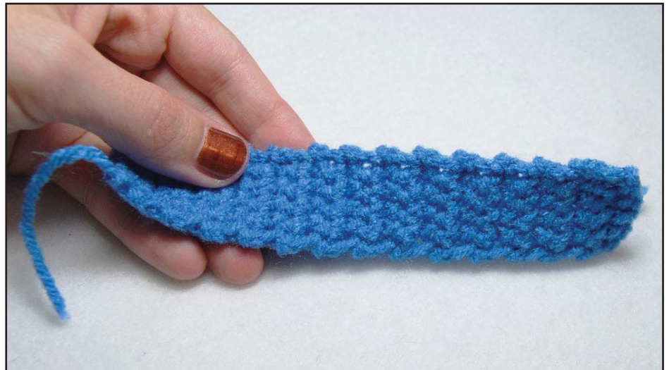
Figure 8: Cuff

Note: If you are making the cuff bracelet for someone under three, leave a little extra room to slide the bracelet over the wearer's hand. Typically one or two rows will work if you are using a stretchable acrylic yarn. See Part 7: Finishing for Children Under Three for more details.