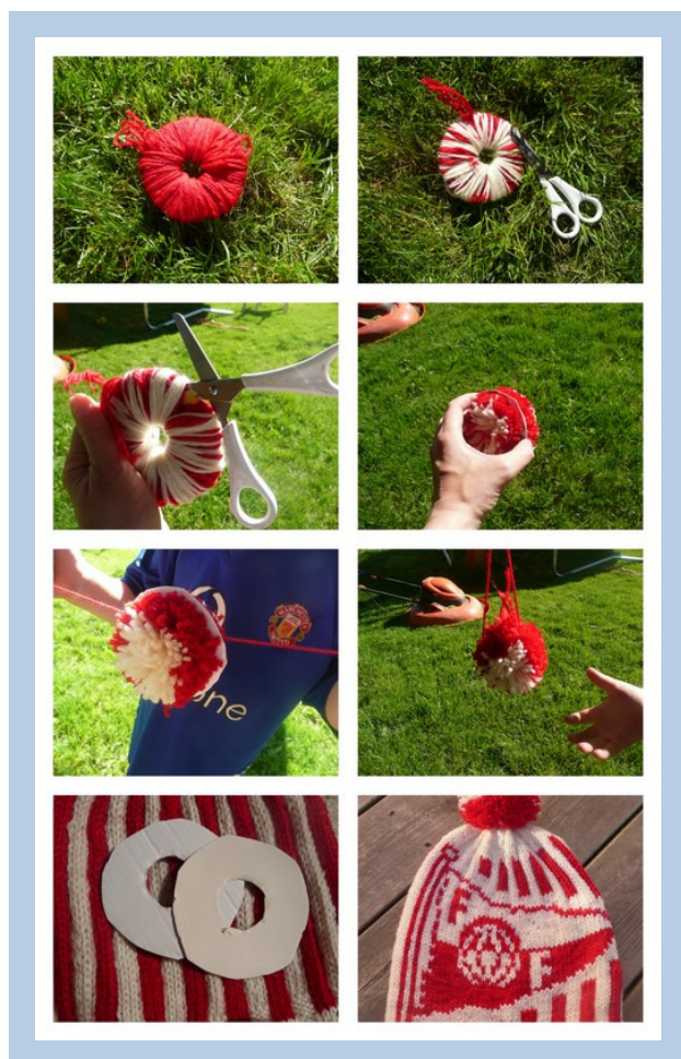
Photo tutorial for pom-pom making

All content and photos are © torirot design. The pattern is for personal and non-profit use only. All rights reserved.