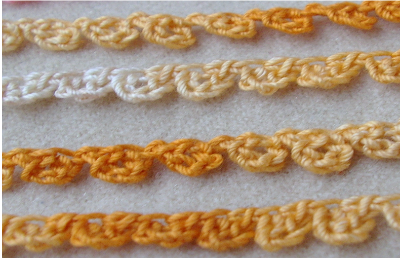
Small loop baby edging