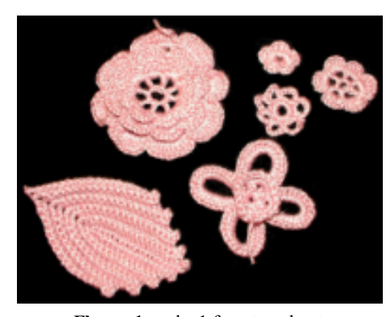
Flower 1: make 1 forget me knot (orange in placement photo)( bottom right side in photo)