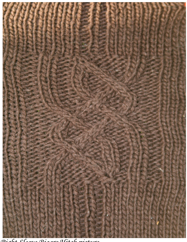
Right Sleeve Bjaars Hitch picture

So therefore, work slightly longer to achieve desired length.