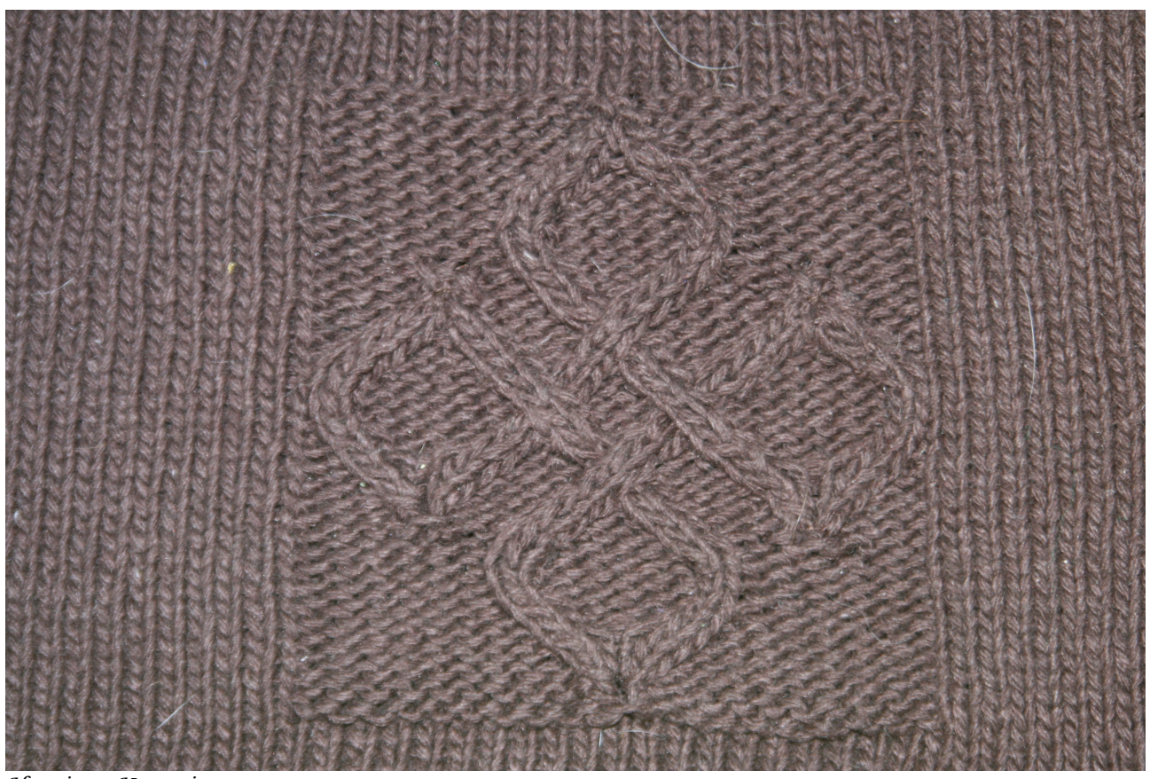
Happiness Knot picture

up. So therefore, work slightly longer to achieve desired length.