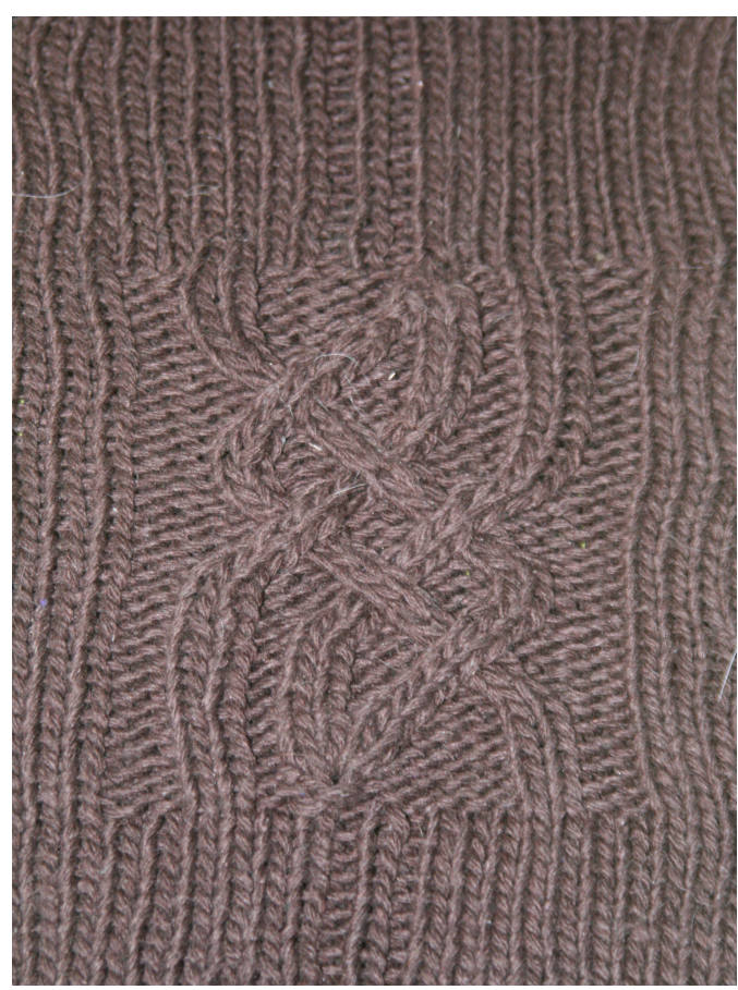
Left sleeve Bjaars Hitch picture

NB: Remember that as this is worked in stocking stitch, the hem of the sleeves will roll. So therefore, work slightly longer to achieve desired length.