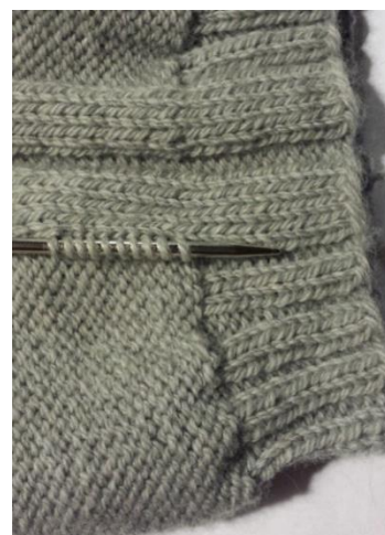
Picture 3 - pick up 10 sts