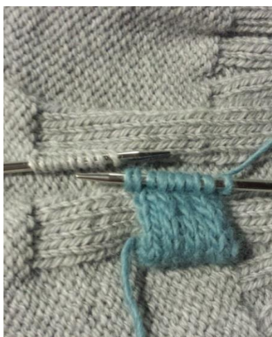
Picture 4 - pick up 10 sts of Right Bar