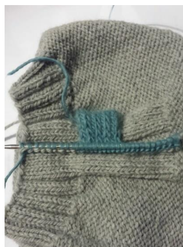
Picture 7 - continue to p10 picked up sts