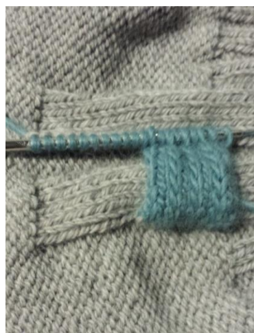
Picture 5 - continue to k10 picked up sts