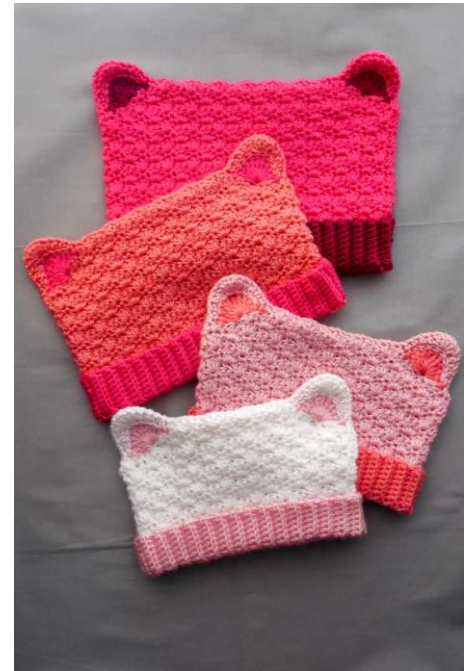
Hats shown made with worsted weight yarn, Large (top) to X-Small (bottom).