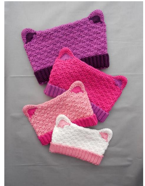
Hats shown made with sport weight yarn, Large (top) to X-Small (bottom).