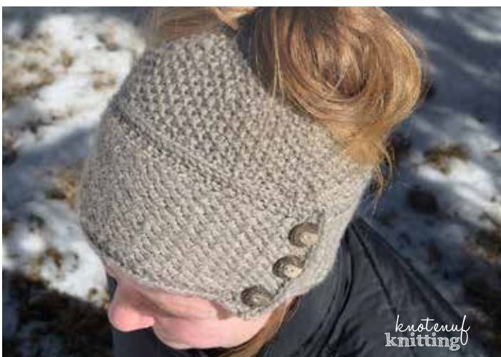
AVA MESSYBUN HAT