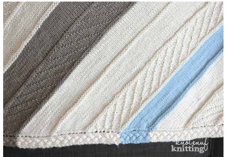
SNUGGLE BABY BLANKET