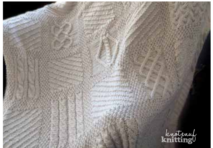
SEAMLESS KNIT SQUARE AFGHAN