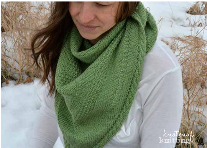
WINTER SOLSTICE SHAWL