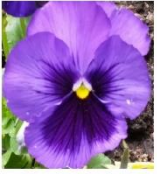
By Denise Bein Kroll