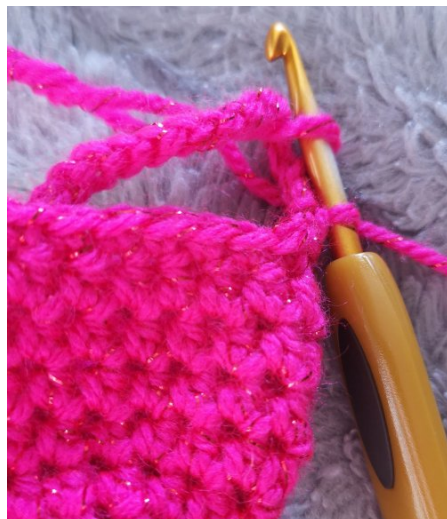
Row 9 – handle. Making scs around the chain.

It will depend upon the yarn you are using. The main thing is to make the handle look neat and with no gaps between sts).