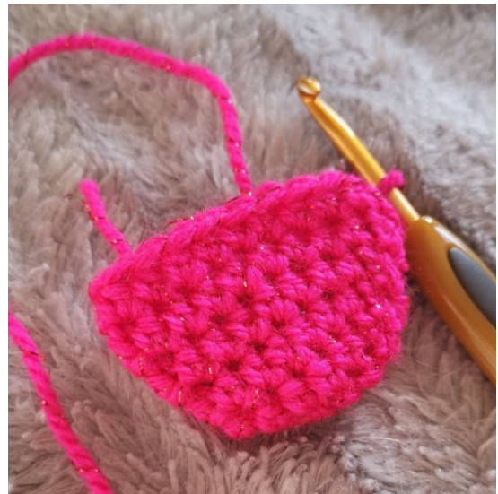
Rows 5, 6 & 7 no increases

You will now have made a sl st join to end Row 7.