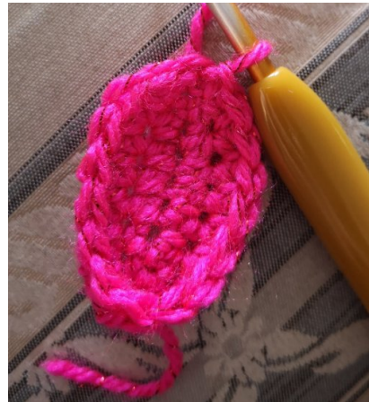
Row 2 completed and sl st joined

Row 2: Ch 2, hdc in next 6 sts, 2 hdc in next st, hdc in next 6 sts, hdc in st at bottom of 2ch start. Sl st to top of ch 2 start to join. (16 sts)