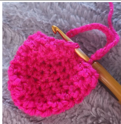
Row 8, joining ch handle with a sc. You will now continue to sc around. See next picture.

Row 8: Makes the handle. Chain 20, sk 9 sts, sc into next (10 th ) st.