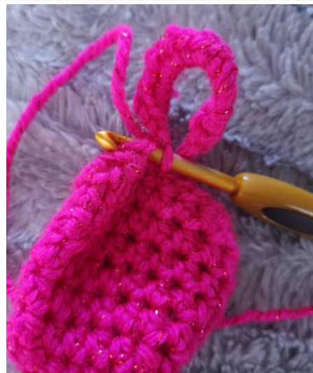
Sl st into sc and cast off.

And that's it. Your tiny basket is completed!