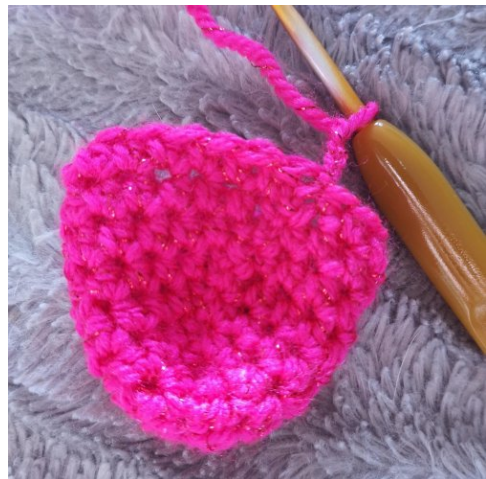
Row 8 begins with a ch from the sl st join

(do NOT cut the yarn, continue with same yarn)