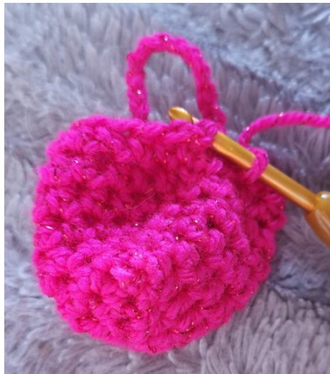
Row 8 sc st around, including sc into st at the base of the ch handle.

Sl st into starting sc (where you joined the ch to the bag)