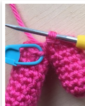
Finger D / Palm: end of round 8

(above stitch marker placed in first stitch of round 8)