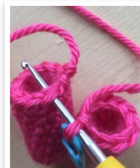
Finger D / Palm: start of round 8