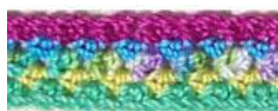
Rio: bright flowers and turquoise seas