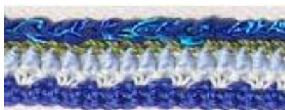
Heron Island: Shimmering ocean and sand